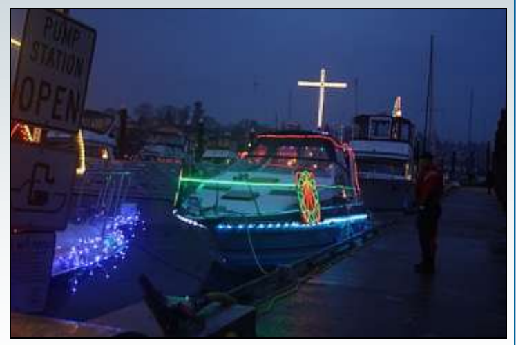
ST. HELENS, Oregon—Lighted boats parked at the dock during patrol at the holiday Christmas Ships festivities.