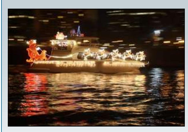
PORTLAND, Oregon—Santa and reindeer catch a ride on a Christmas boat during the December, 2011, Christmas ships event.