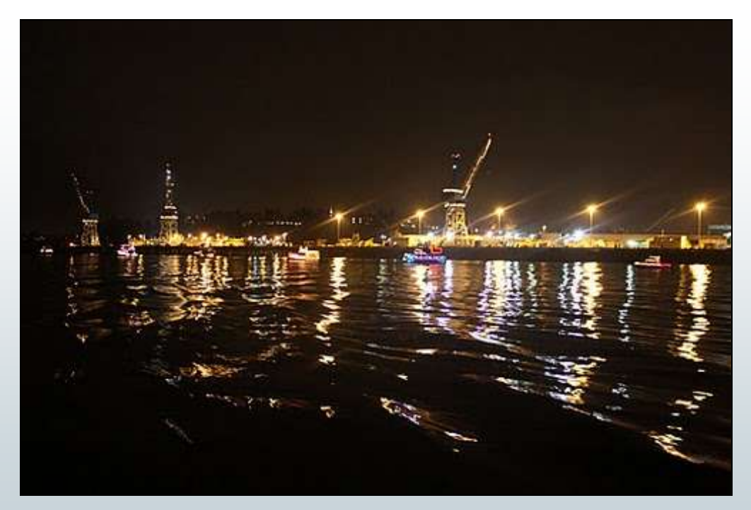
PORTLAND, Oregon—Christmas ships cruise by Vigor Industrial Shipyard on Swan Island in December, 2011.