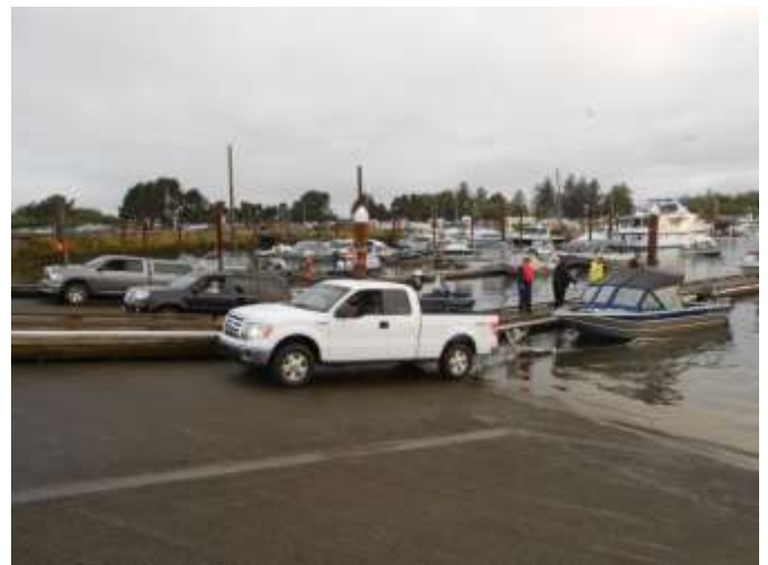
Things have calmed a bit by daylight; instead of 6 boats launching at the same time there are only 3

The program put together by the US Coast Guard and Flotilla 62 was exceptional.