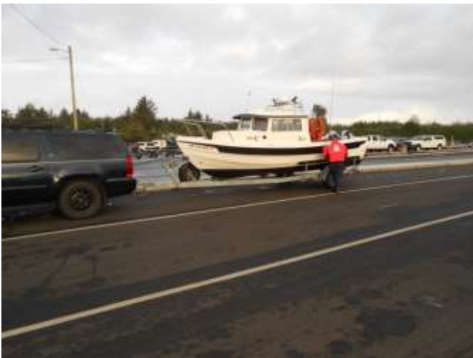
Bob talking with a boater