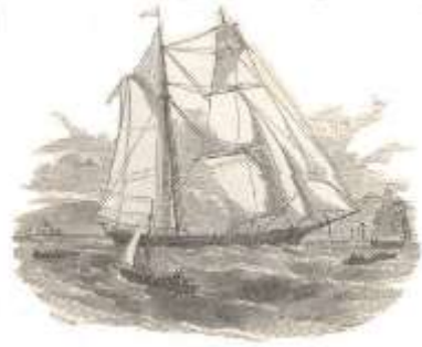
THE MORNING STAR.