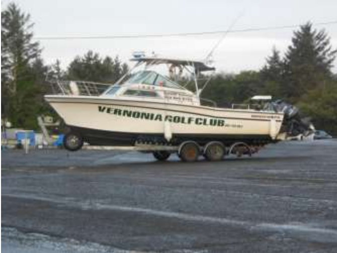
Apparently 5 wheels work just as good as 6 to get the boat launched!