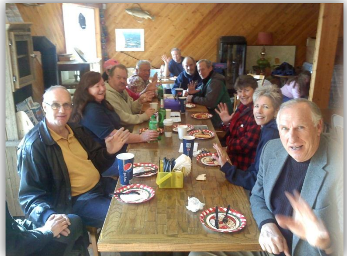
A full Auxiliary Member is a happy Auxiliary Member

The proprietors of the Bar View (Jetty) Store have once again shown their appreciation for the shipmates of coast Guard Station Tillamook Bay by opening up their front doors,... and their oven doors,... for an all-you-can-eat pizza feed. Thanks for all who participated (pass the pepperoni!), Coast Guard personnel, Auxiliary Members and families! For more than a couple years now this tasty event has been a great opportunity for fellowship and full bellies. Thank you Bar View (Jetty) Store, we could not do this event without your generous support! See you all next year! Bon Appetit!