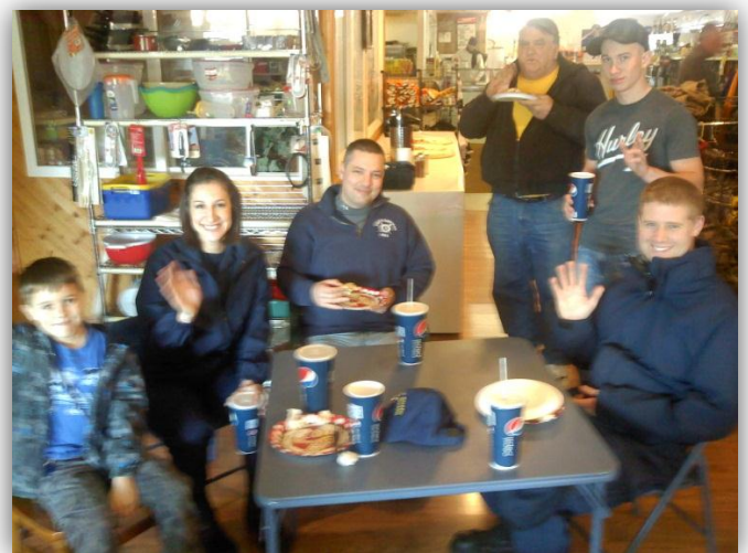
Coast Guard and pizza go great together