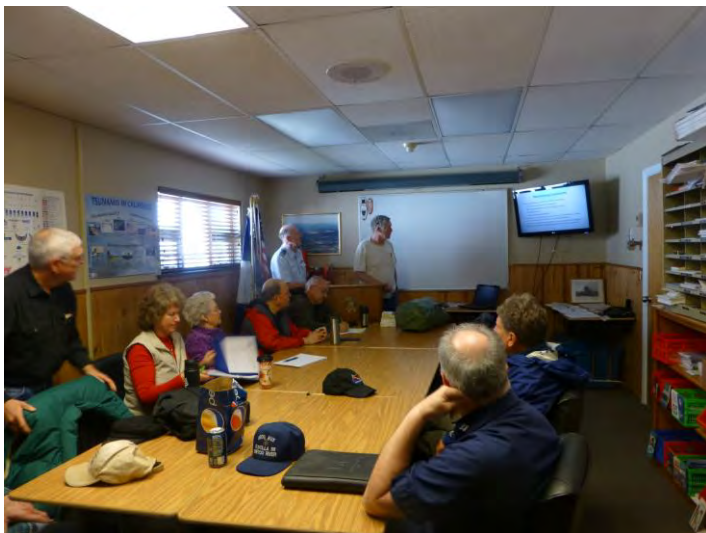
April 2, Vessel Exam 1 hr Workshop and 1 hr training