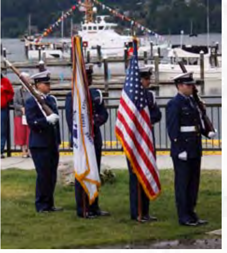
July, Change of Command, Poulsbo, MFPU Maritime Force Protection Unit USCGC Sea Devil