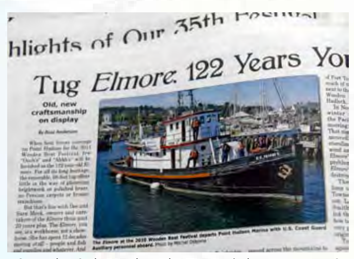
September, 35th Annual Wooden Boat Festival Program, page 12. USCGAuxiliary Facility, The Elmore in Port Townsend