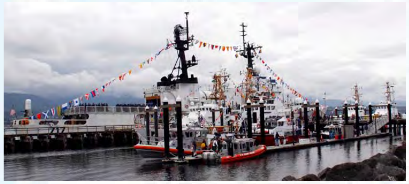
June: USCG Air Station/Sector Field Office Port Angeles hosts the Centennial of Naval Aviation & Safe Boating Expo