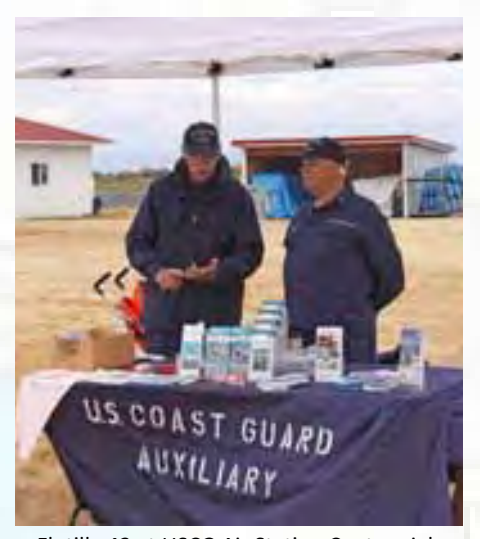
Flotilla 42 at USCG Air Station Centennial