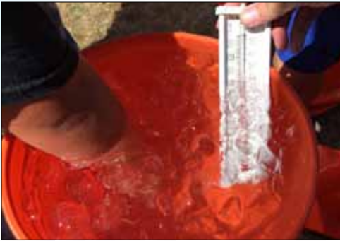
Hypothermia demonstration tank is a kid's favorite at Unity of Effort

Flotilla 47 Port Townsend members supported key community events, recreational boating safety, and an international multi-agency emergency preparedness drill as representatives of Team Coast Guard in 2016.