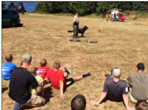
Security dog demonstration at Unity of Effort