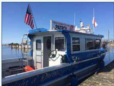
Stravaigin a' Dorné