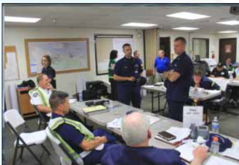
Clallam County Emergency Ops Center

Getting on scene for the media boat would take about sixty minutes as they headed out to approximately six nautical miles off shore in the Strait of Juan de Fuca just off Ediz Hook to a predetermined accident location outside of the major shipping lanes. The CGC Wahoo from USCG Station Port Angeles was on scene along with a 45’ RBK-M. Upon hearing the distress call, members of the Canadian Coast Guard/Armed Forces (47’ MLB red color and a bright yellow Rescue Helo) arrived on scene to help evacuate the injured.