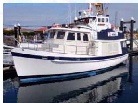
AT EASE stands by to support the Mass Casualty Drill at Station Port Angeles