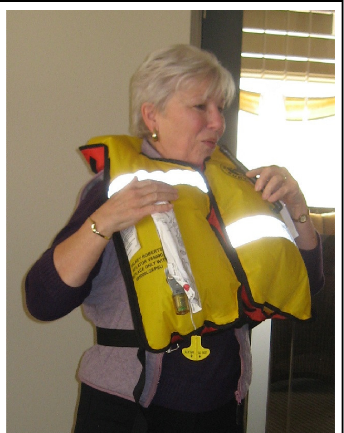
A brave student demonstrates the proper way to wear an inflatable PFD.

to learn where the safety equipment is found and how to use it, as well as some questions to improve communication with your boating partner to ensure the safety and enjoyment of your boating trips. Boating should not be "a man's dream and a woman's nightmare." The DVD "Cold Water Boot Camp" demonstrated the dangers of boating in the cold waters of our area in the Northwest, especially without a lifejacket.