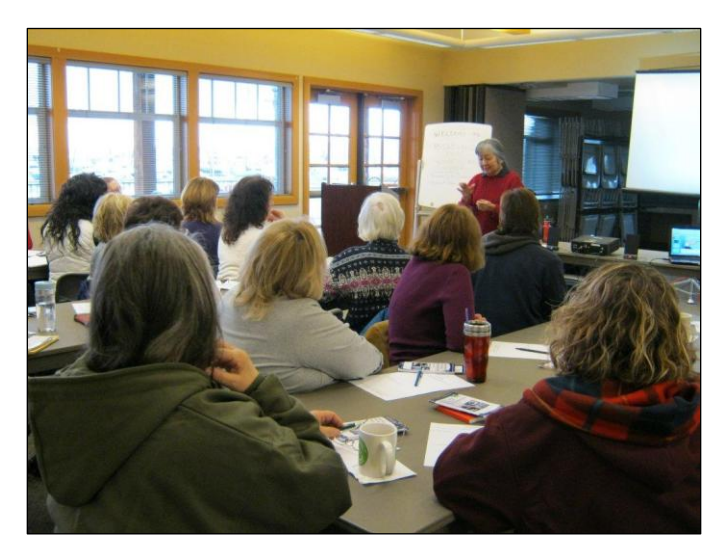
Suddenly In Command: Women's safe boating class in January 2011.

Flotilla 19 is offering a special boating course for women presented by women of the U.S. Coast Guard Auxiliary on Saturday, October 15, 2011 from 12 noon to 4 pm at Blaine Marina conference room. This course is for women who are interested in boating, who may be married to a boater but feel they are just there to provide the lunch, women who go out as passengers on other people's boats, or who may be anxious about boating altogether and would rather leave boating up to the men!