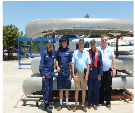
VE "Blitz" at San Diego Youth