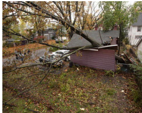
Some of the storm damage in Princeton, NJ