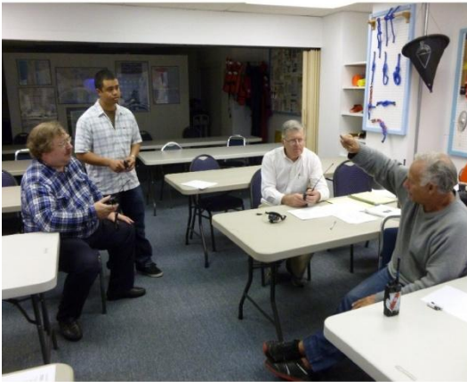
TCO Training at Maritime Institute Aquatic Center