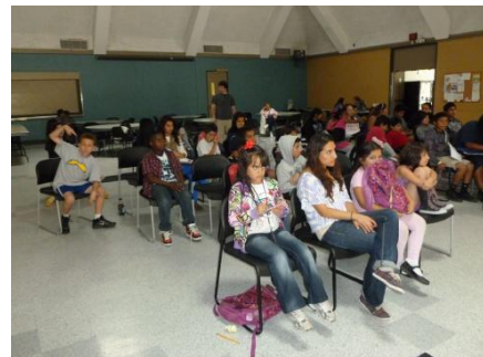
PE Event: Chula Vista "Inky the Whale"