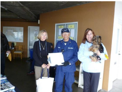
VE & Dockwalker Program at Bay Club Marina