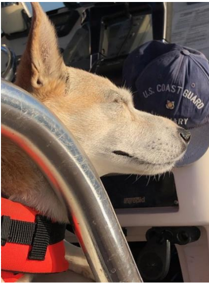
Callie's favorite place on the waterways!