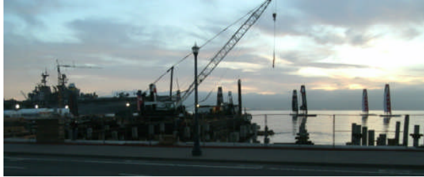
Early morning shot near Pier 32 of the USS Makin Island (Amphibious Assault Carrier) and race boats from America's Cup from a MUNI bus

Flotilla 17, Point Bonita District 11NR-Division 1 United States Coast Guard Auxiliary