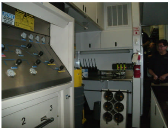
inside one of the rolling command centers above

On October 5 th , I reported in at Pier 80 and was assigned as a greeter for the USCGC Sherman. I must say she was well hidden as we didn't get a lot of foot traffic that morning. Our neighbors just to our North were 3 Canadian ships: 2 mine sweepers – the HMCS Edmonton, the HMCS Brandon & the HMCS Algonquin (destroyer) along with the USS Preble the USS Spruance – both guided missile destroyers