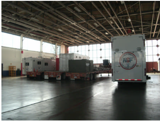
these trailers can fit into a C130 along with the truck