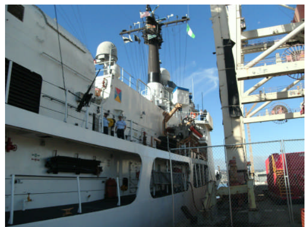
the Sherman just returned from San Diego