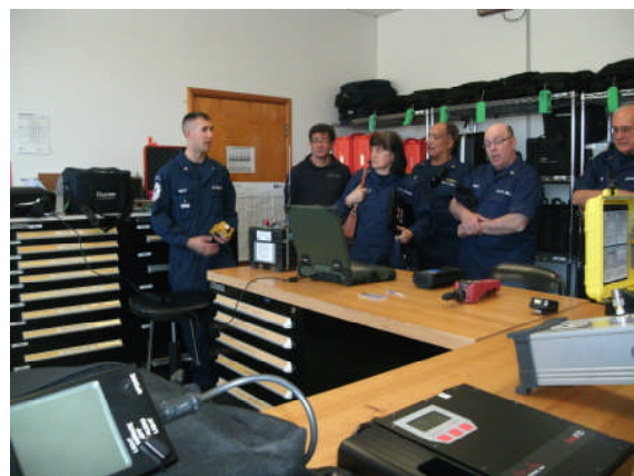
viewing some of the equipment to measure radiation and toxins

All teams stand by ready to deploy 2 members immediately, 4 members within 2 hours, 12 members and equipment within 6 hours. Though, they have a small number of personnel, they can rapidly put together large teams anywhere they are needed.