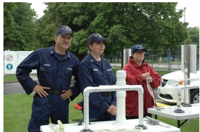
Members of Flotilla 3509 try their hand at Marlinespike.