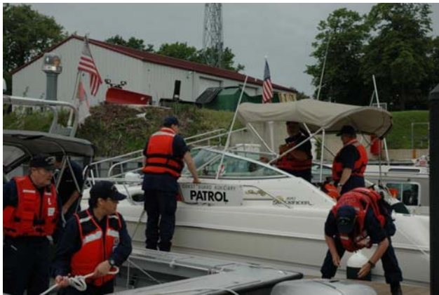
Crews of BellsAR and NU-SAR break for noon chow.

When the District Commodore recently attended the Change of Command for the District Commander, she shared with the new Admiral her experience at our Boat Camp. As a result, we have been asked to share our “template” for success with the rest of the District.