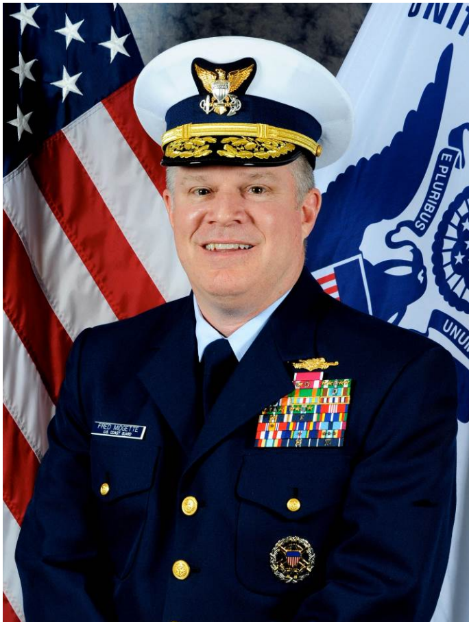
RDML Fred Midgette, Ninth District Commander

Boat Responsibly - Wear your lifejacket, designate an operator if you chose to drink (1 drink underway has same effect as 3 ashore), and have a memorable day on the water!