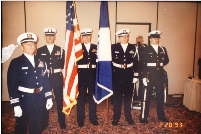
9WR Color Guard in 1993 at a District Conference

In response to the growing number of requests for Color Guard representation, especially at parades and funerals, Division 35 is working to develop a skilled cadre of members who are willing to fill this mission.