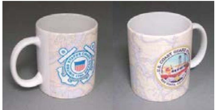
Sample mug above shows Station Rio Vista's logo.