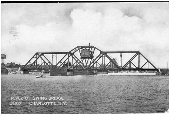
Image from a 1908 postcard - Hojack Bridge across the Genesee River

A part of Rochester history is gone but time marches on. New development is planned that will change the face of the Port of Rochester. A new marina, businesses, residential units and a public walkway connecting the River Trail to the Charlotte Pier are included in the plans for the city's Port of Rochester Marina Project. All of us in Flotilla 42 are witnesses to all that is happening at the mouth of the Genesee River. As we step out on the dock at the 42 Base it will be exciting to watch as the landscape changes, but I, for one will miss seeing that old Hojack Bridge standing guard in the river.