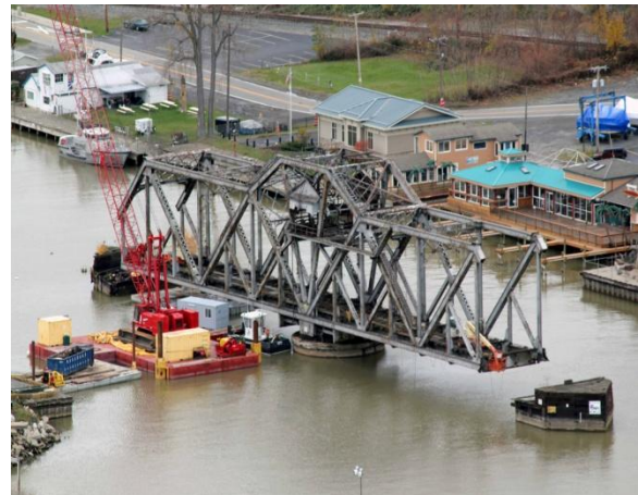
Taken during Air Patrols - Photo by: B. Brody