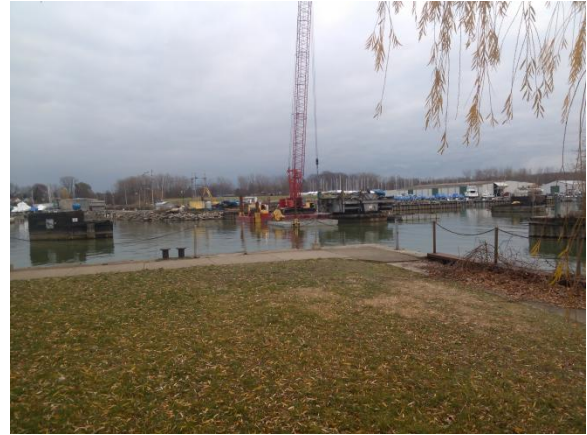
The final Days of the bridge