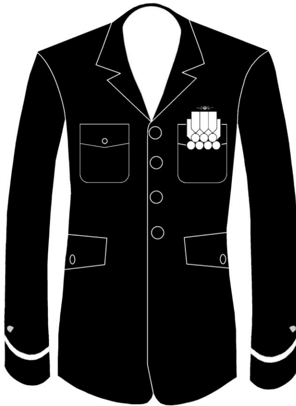
Figure 10-22 Dinner Dress Blue (Men)

The Dinner Dress Blue uniform is worn for formal evening occasions when the Auxiliarist does not have the Dinner Dress Blue or White jacket. It is the same as the Service Dress Blue, except miniature medals, miniature breast devices, and a plain black bow tie are worn instead of ribbons, name tag, and the four-in-hand necktie. The AUXOP and past officer devices, for which there are no miniatures, are also worn. Only the combination cap is appropriate for wear with this uniform. (see Figure 10-22)