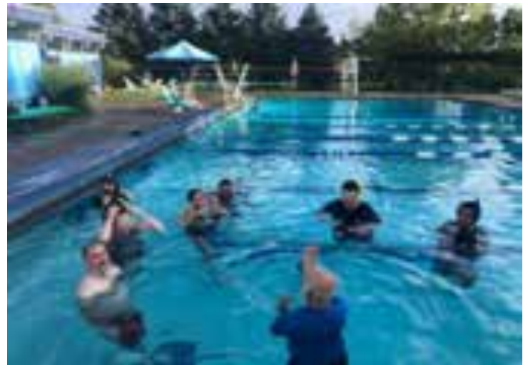
Left: Scuba class instruction on how to properly fit and use your mask