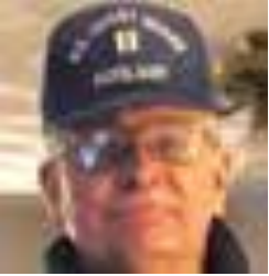
FC Ben Gardiner

How time flies! Here we are into the Month of October already. We have pulled the Flotilla docks and they have been secured for the winter. Next to come out of the Water is the Base Boat and all of a sudden summer is over.