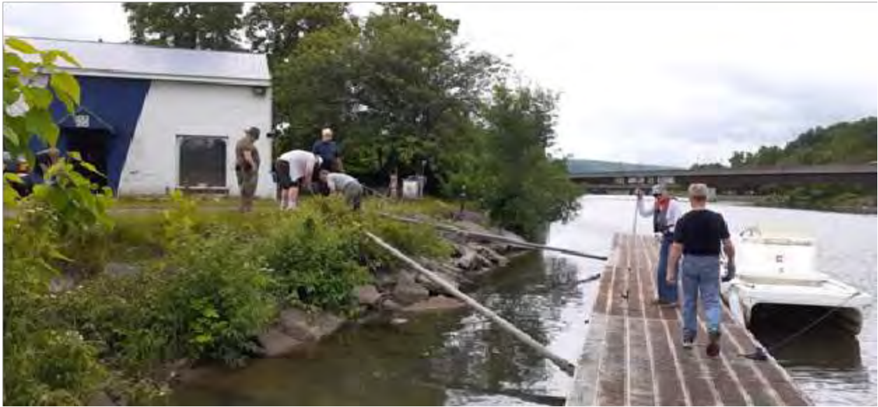
Attaching the dock to shore.