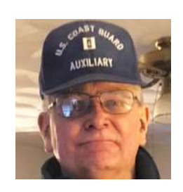
From the Helm By FC Ben Gardiner

Shipmates, as we continue to enjoy the balmy breezes of summer, we must remember that our Flotilla elections are just around the corner. Clearly ensuring that we have an orderly change of leadership and a smooth transition to that new elected leadership in Flotilla 22 is critical to the continued high-level performance of this organization.