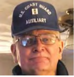
FC Ben Gardiner

Flotilla 22's operational tempo has ramped up considerably over the last few weeks as we returned to underway operations on Cayuga Lake. Certainly, good to get our sea legs back!