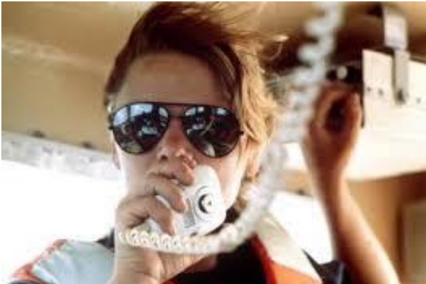
USCG Auxiliarist sending marine VHF radio traffic.

"Dudes, this is Coast Guard Auxiliary 800, sending a shout out on 16 to see where all my peeps want to hook up and have lunch.....shoot some flash traffic back at me....over and out!" I cringed just writing the above.