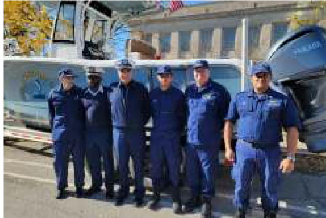
The Crew Aboard the Facility During the Parade