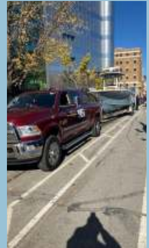
The Facility in Tow