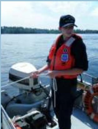
Ready to Dock

“... is not that difficult to complete the courses.”