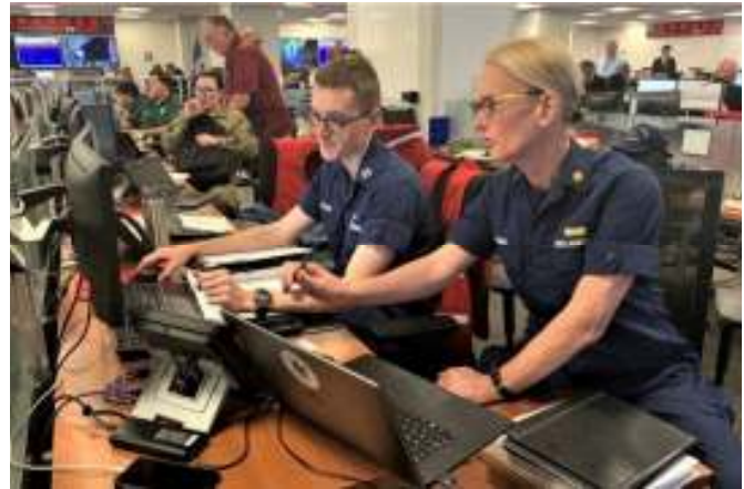
Mentoring Is Part Of The Auxiliary

For BQC-II you need to understand the background and history of the Auxiliary as a prerequisite