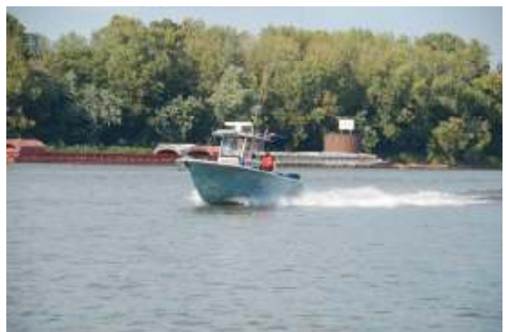
Tailwalker Too on Ohio River

those in AP Status to move up. It does not look good for Division I or your Flotilla if you have a high number in AP Status. Support your Flotilla with mentors to encourage they help those listed as Application Pending. We need to help them become Initially Qualified (IQ) or Basically Qualified (BQ). If we can do that, we can quietly stick our chest and feel “Look what I did.” Be proud of it.