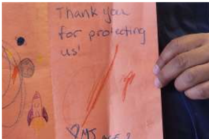
Back of the Thank You Note