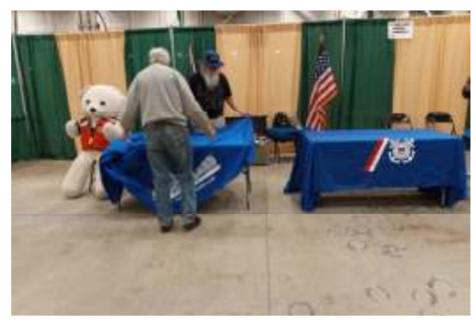
Setting Up At The Boat Show