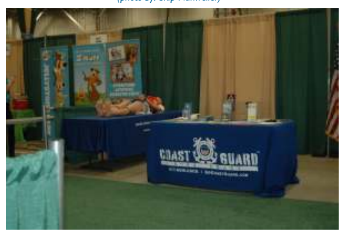
Our Booth Showing the Overboard Dummy

this newsletter of that day of training. Many who signed up for the Boat