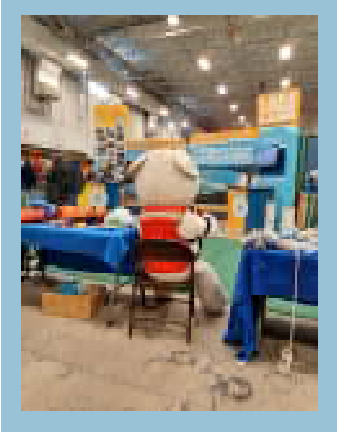
Ted E. Bear On Watch

"... had its normal spot that is donated ..."