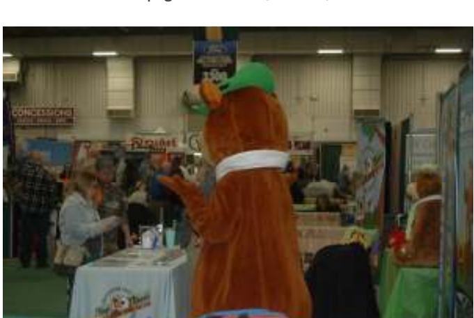
Yogi Bear In A Nearby Booth