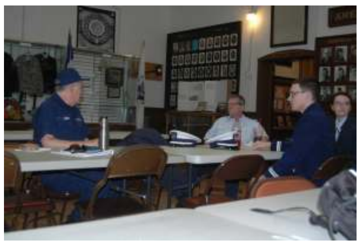
Students Ready to Learn

The teaching is out of the Boat Crew Manual. Most everything covered is out of the manual. By the end off the day most of the trainees can pass that part of the test which must be