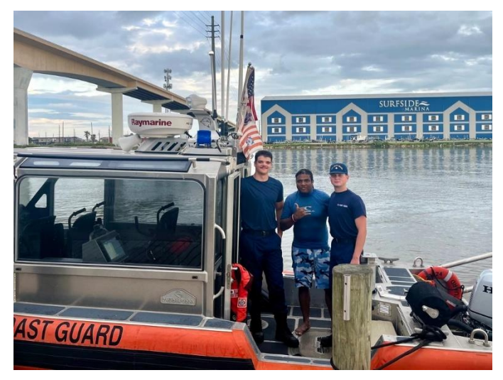
Rescued surfer with Coast Guard.

standers call from a friend of the surfer at 5:31 p.m. reporting a male surfer stranded offshore.