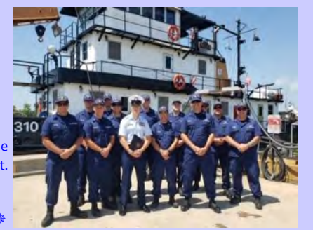
sports-fans and look forward to their posting. The Axe Crew appears to the right.