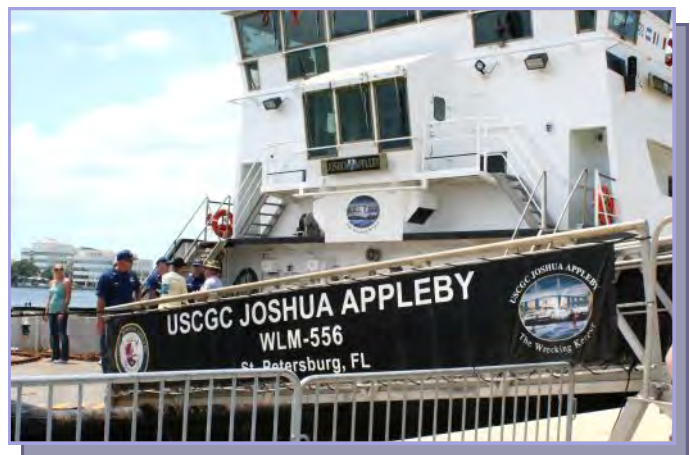
USCG cutter, Appleby , which is primarily used to service ATONs.