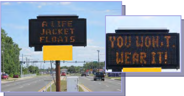
Citrus County Sheriff's office placed this electronic sign on the median of US 19 in Crystal River, flashing, "A Life Jacket Floats, You Won't. Wear It!"