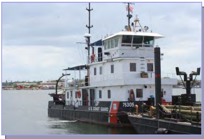
USCG tug, Vise , and barge used to maintain ATONs.