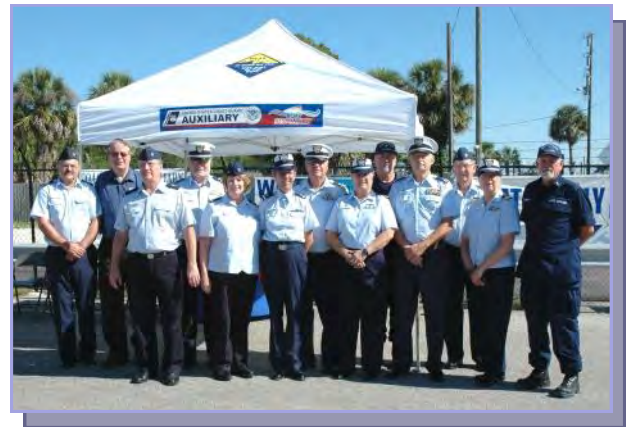
15-8 members, guests and painters prior to the start of the ceremony.