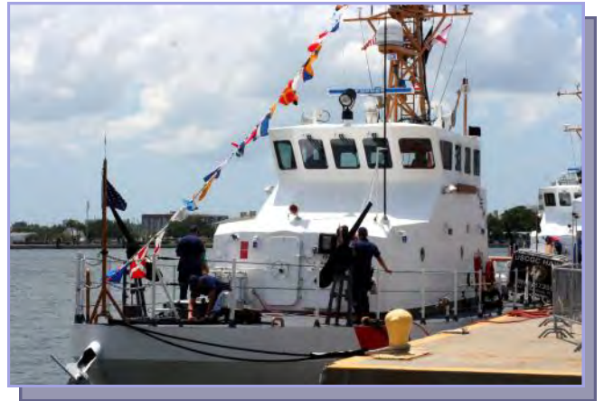
USCG cutter Hawk at Sector St. Petersburg's Open House.