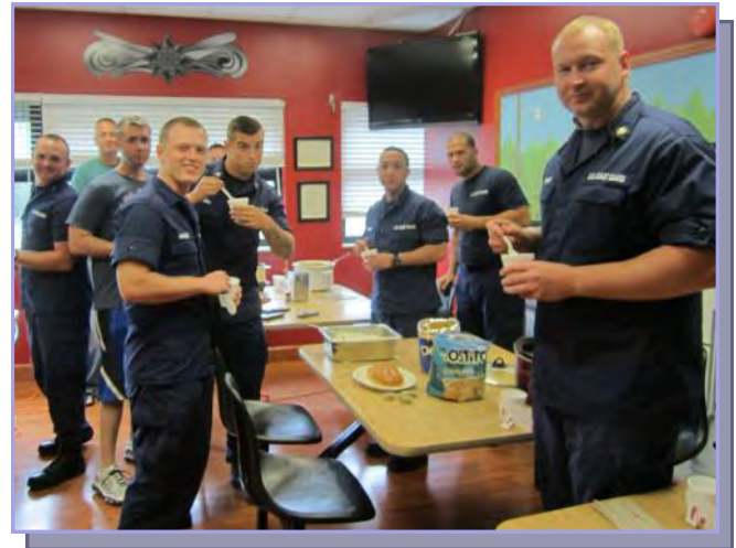
Chili Taste-Off