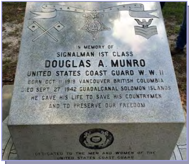
Monument commemorating Douglas Munro, the only member of the U.S. Coast Guard to receive the Medal of Honor. He received the Medal for his heroism at Guadalcanal during World War II. The monument is in Crystal River, FL.