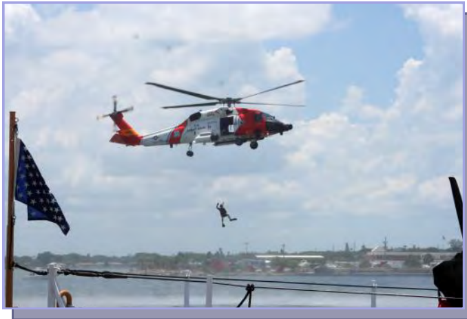
Rescue swimmer demo with an HH-60 J-Hawk helicopter.