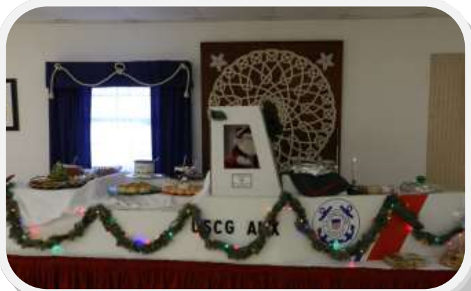
Cookies for Coasties. Flotilla 15-8 had a large table of cookies for the active duty.