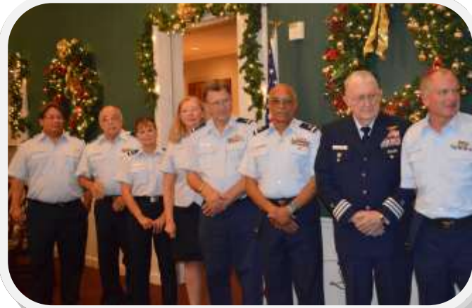
15-1 FSOs for 2014.