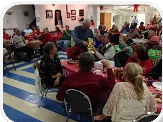
15-8's Christmas party.