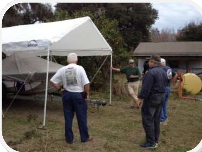
Flotilla 15-3 put together a work party to erect a canopy over their facility, Paratus .