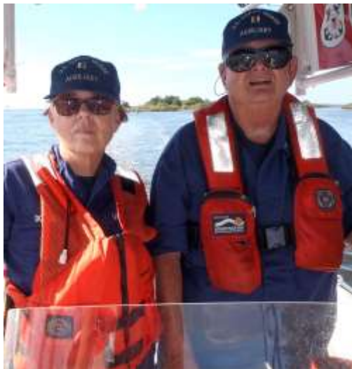
The Dooris's on patrol.