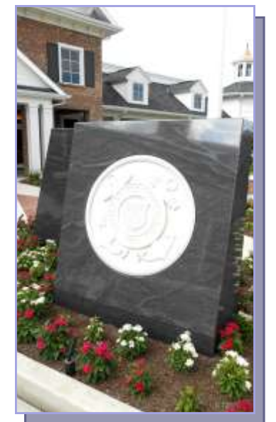
U.S. Coast Guard Monument. 15