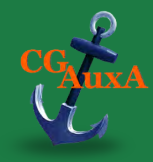
Coast Guard Auxiliary Association