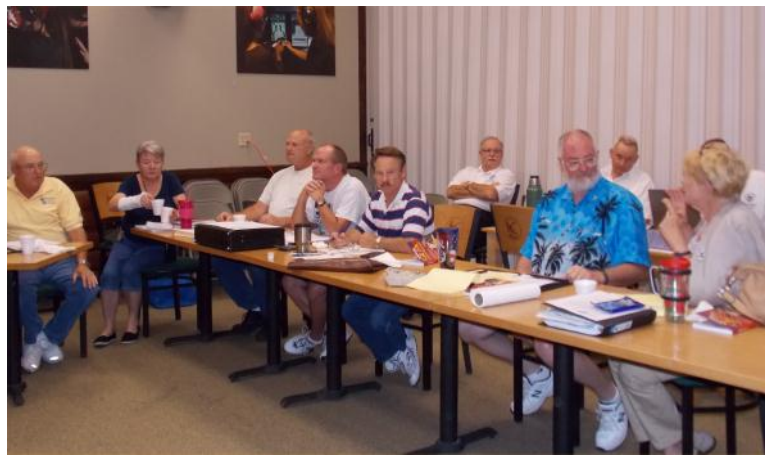
Second class day—after a short break, students were ready to tackle the subject, "Amateur Radio Equipment."