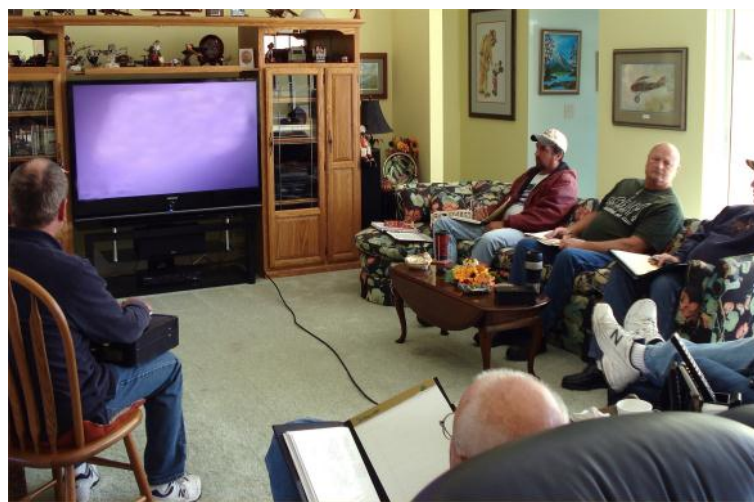
The third class venue was Chuck Trathan's home. Students are shown here getting ready to watch the PowerPoint presentation.