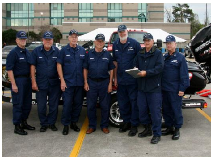
Group photo of Bassmaster Tournament VEs from Flotilla 081-06-11 in Orange, TX, and Flotilla 15-3, Ocala, FL.