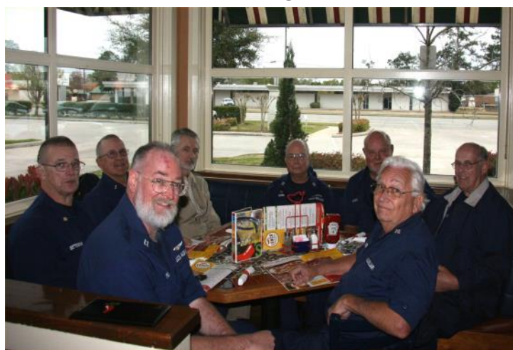
Fellowship lunch after doing all the VEs at the Bassmaster Tourney.