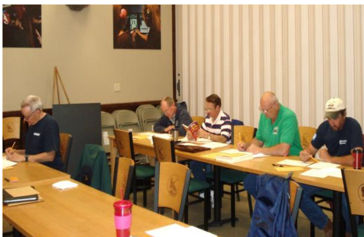
Students taking exams.