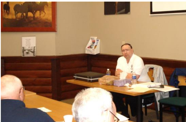
Last Amateur Radio/AUXCOM class—reviewing ham radio terms.