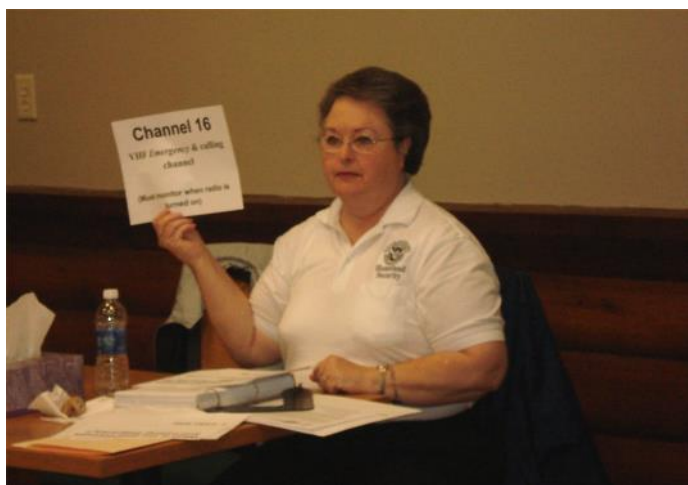
'Flash cards' review of AUXCOM questions.