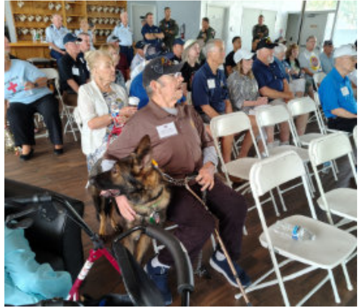
Some Legion of Valor members had their service dogs with them