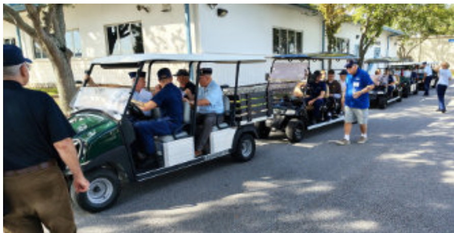
Transportation to the hanger

The program then moved on to the hanger to show the Legion members some of our planes and equipment.