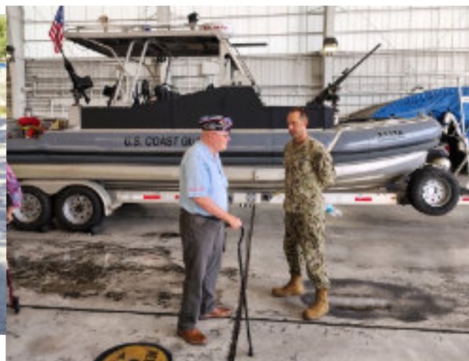
Armed 323134 military boat