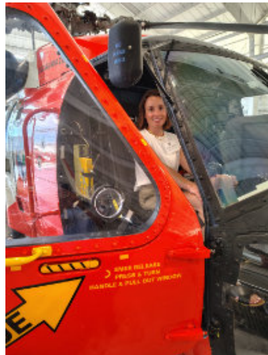
Legion member's wife enjoying the pilot's seat