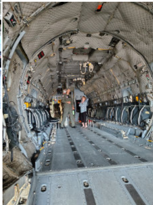
In the belly of a C-27J aircraft