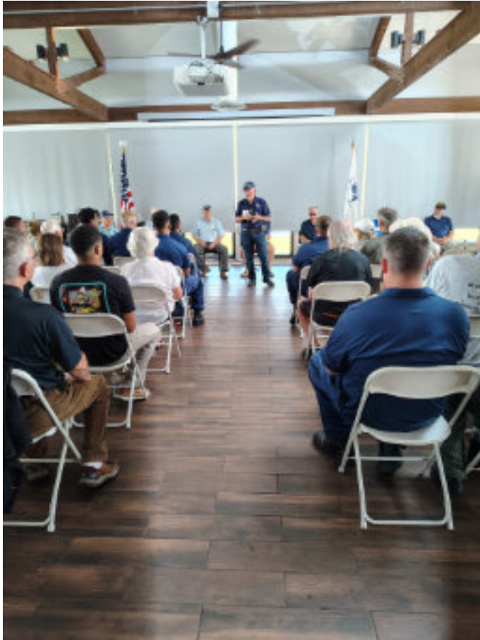
Legion of Valor members sat up front for discussions

The Legion of Valor members were then escorted back to the Red Tail Lounge where each member gave a synopsis of their active duty experiences and answered questions from the audience. At the end of the session, everyone finished the day with lunch at the gallery.