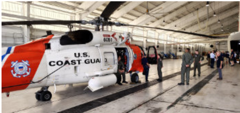
Helicopter and pilots ready for questions