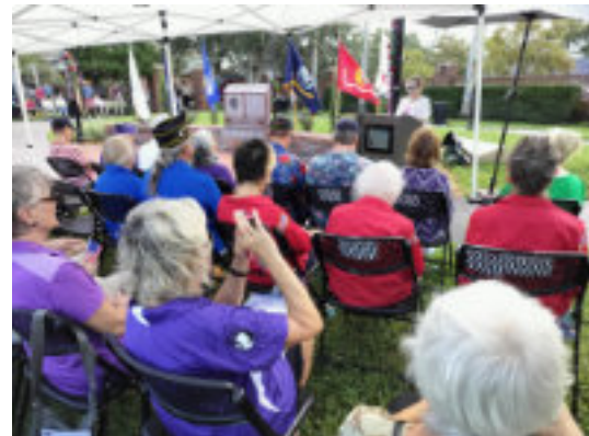
Reading Soldier's Battle Prayer