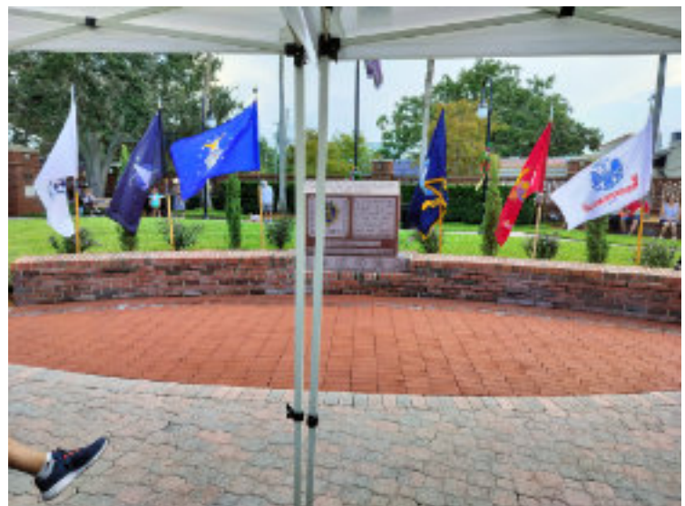
Color Guard presentation