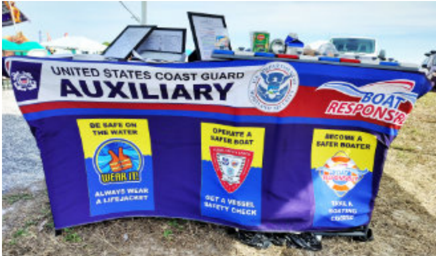
Dunedin Flotilla 11-10 booth setup

The parks system of the Florida Dept. Of Environmental Protection put on a special event consisting of many vendors and exhibits from many various organizations. The Dunedin C. G. Aux Flotilla 11-10 was also asked to participate to promote boat safety since the administer of this event is a past Coastie.