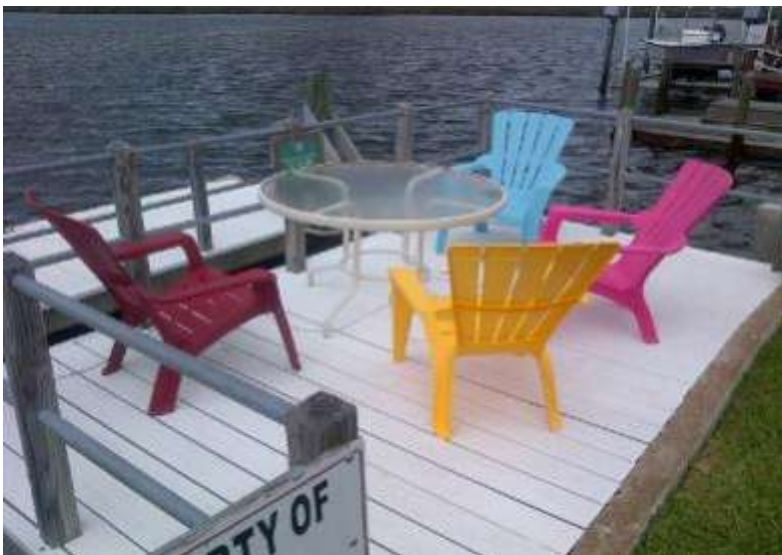
14 March 2012 New Port Richey, Florida . New Deck Chairs for Flotilla 11-06 Boat Dock.