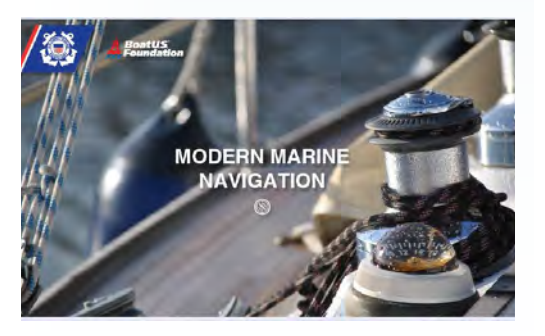
Semper Paratus - Always Ready

The Coast Guard Auxiliary, America's largest volunteer boating safety education organization, partnered with the BoatU.S. Foundation to develop an online education course that provides the recreational boater with a comprehensive navigation training program. The program has been approved by the Coast Guard Navigation Center and is now available to the public via the Coast Guard Auxiliary website at www.cgaux.org/mmn