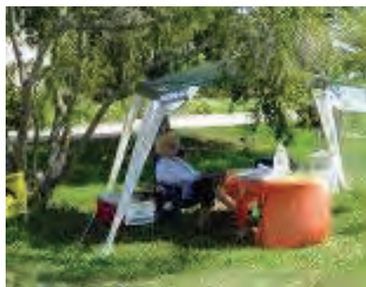
"Save the Manatee" Rescue