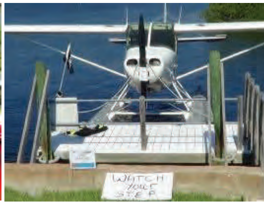
Vintage 1948 Seaplane Display