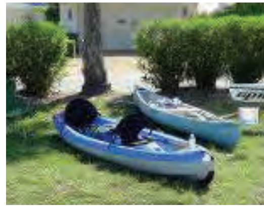
Canoes and Kayaks Display