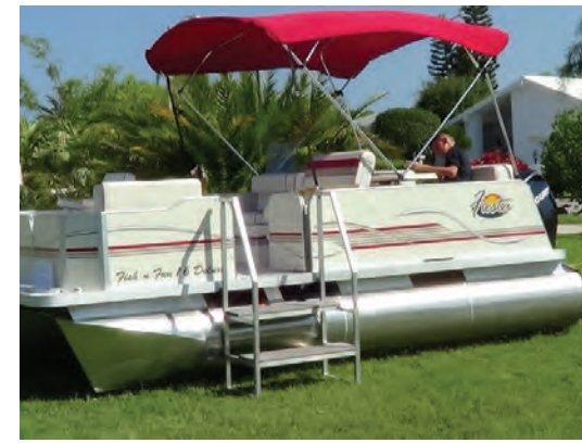
Pontoon Boat Display