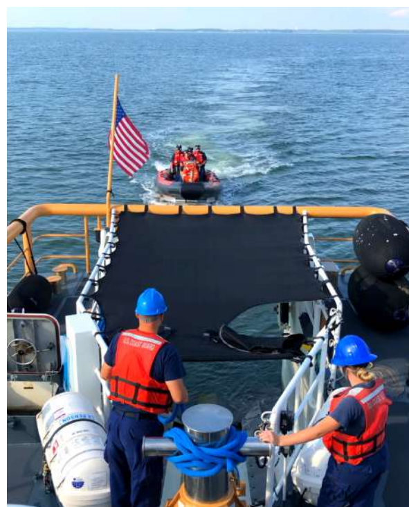
The POMPANO boarding team lines up to the receiving bay.