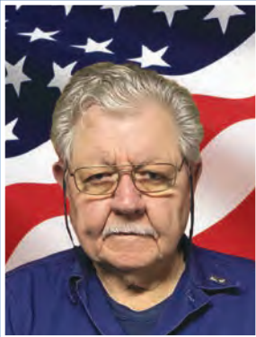
August Miller Navigation Systems