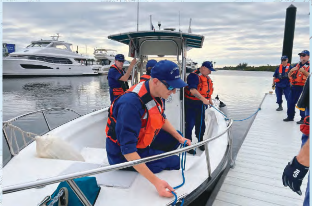
Below: Mentors, qualified crew members and trainees prepare to board for on-the-water training.