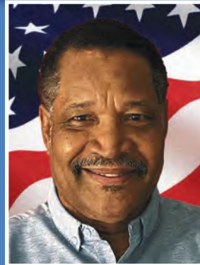
Earl Abbott Finance

Ordered and received vessel inspection forms and decals.