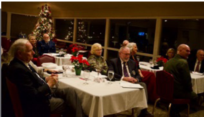
Flotilla members and Distinguished Guests