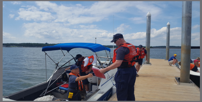
Underway Anderson County Green Pond launch dock.

Flotilla 25 charter turns 30 on January 30, 2018. Providing recreational boating safety, vessel safety checks, marine education, safety patrols, aids for navigation and other services supporting the Coast Guard for 30 years.