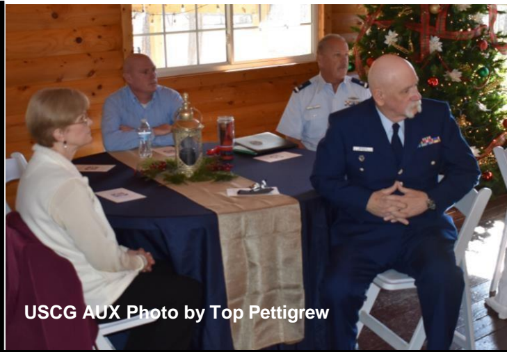
USCG AUX Photo by Top Pettigrew