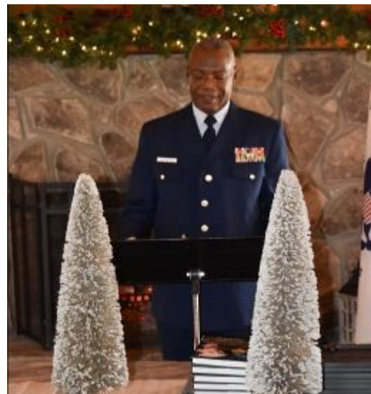
Top addresses the members and guests during the Change of Watch.