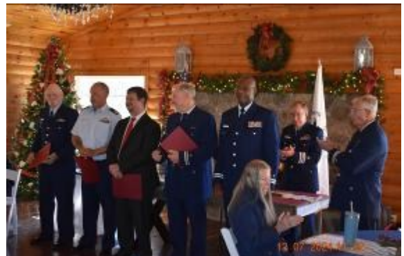
Newly elected staff officers of Flotilla 054-26-07 gather together to accept the responsibilities of their positions.