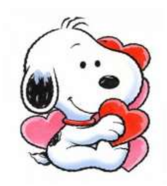
Happy Valentines Day