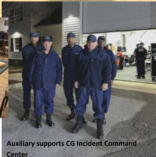
Auxiliary supports CG Incident Command Center