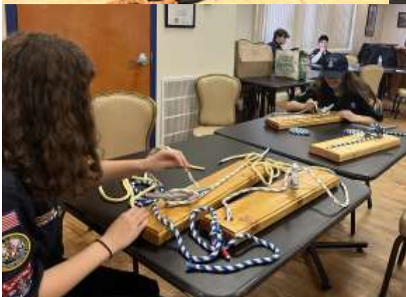
Sea Scout Ship 1959 Open House.