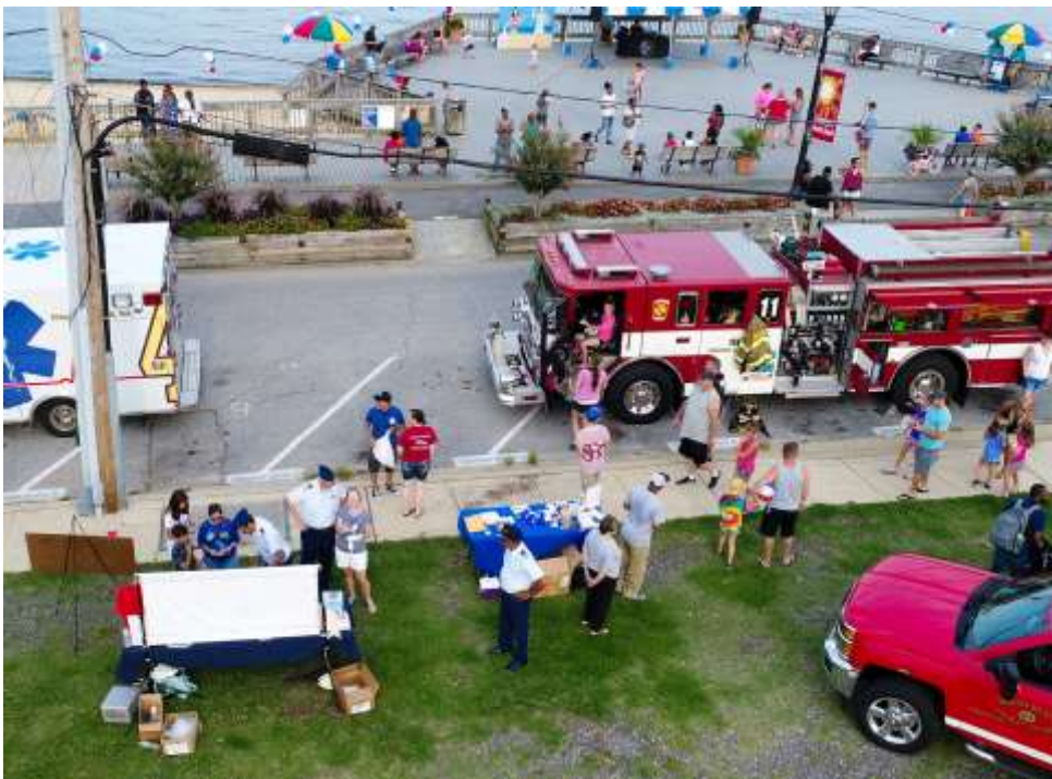
National Night Out in North Beach as seen from a drone. 23-6 new member Elaine Griffin was the photographer and drone operator.