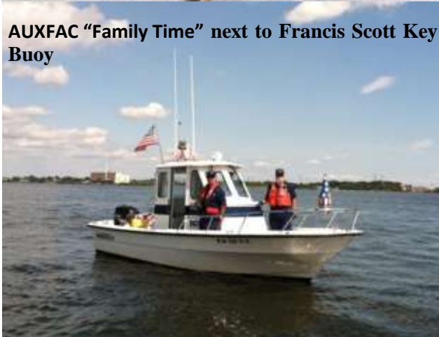
AUXFAC "Family Time" next to Francis Scott Key Buoy