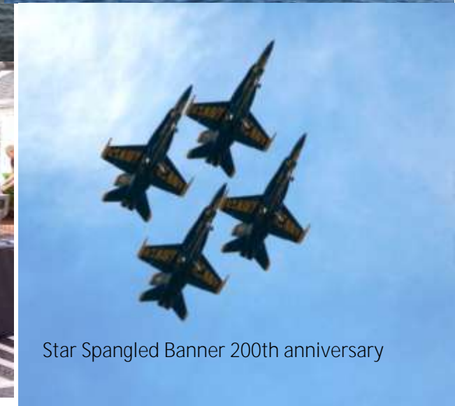
Star Spangled Banner 200th anniversary