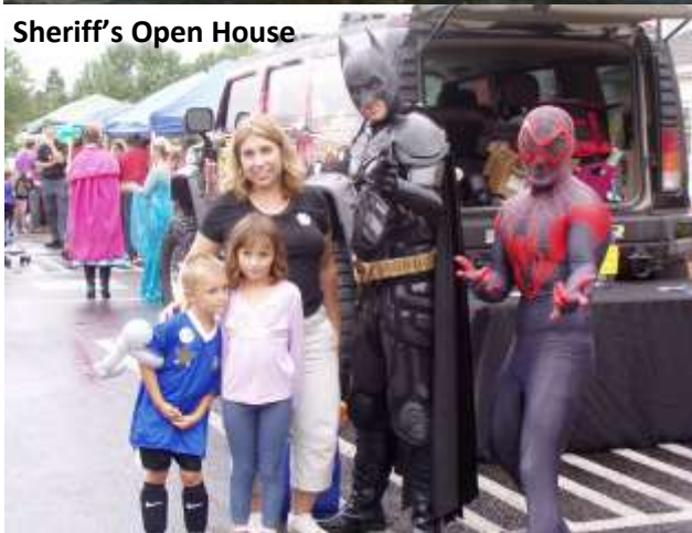
Sheriff's Open House