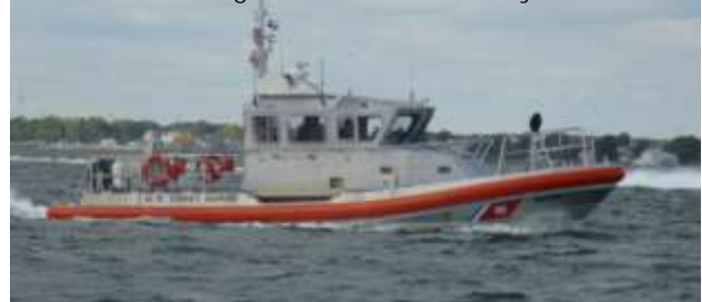
Station St. Inigoes 45713