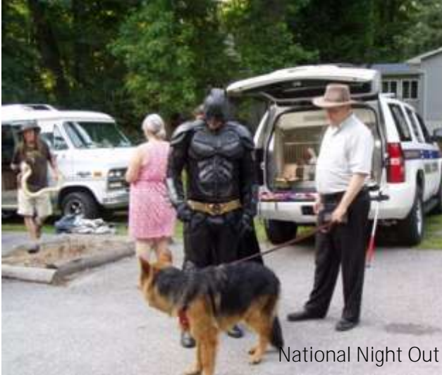
National Night Out