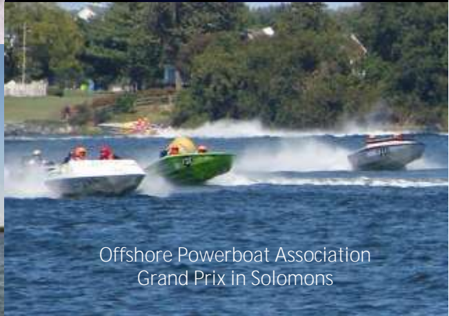
Offshore Powerboat Association Grand Prix in Solomons