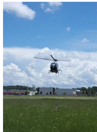
Here comes help