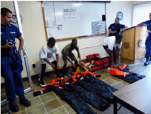
Survival suit drill