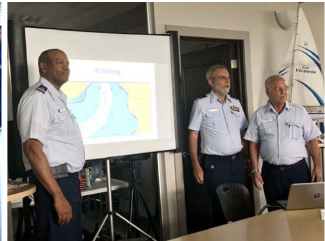
Instructors at work

Each summer the Beaufort County Police Activities League (BCPAL) conducts a four-week aviation, boating, and marine ecology camp. From June 12 until July 7 2017, students learned about flight aerodynamics; desktop flight training device and a real airplane; swimming; scuba diving; sailing, building a hot-air balloon and a hydro-electric powerplant, boat buoyancy projects, marine ecology, and visiting military bases including a field trip to USCG Station Hobucken.