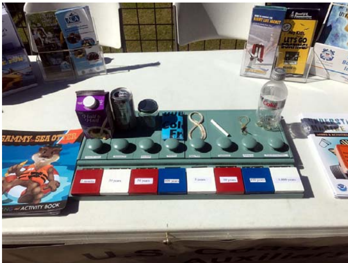
How long does it last?