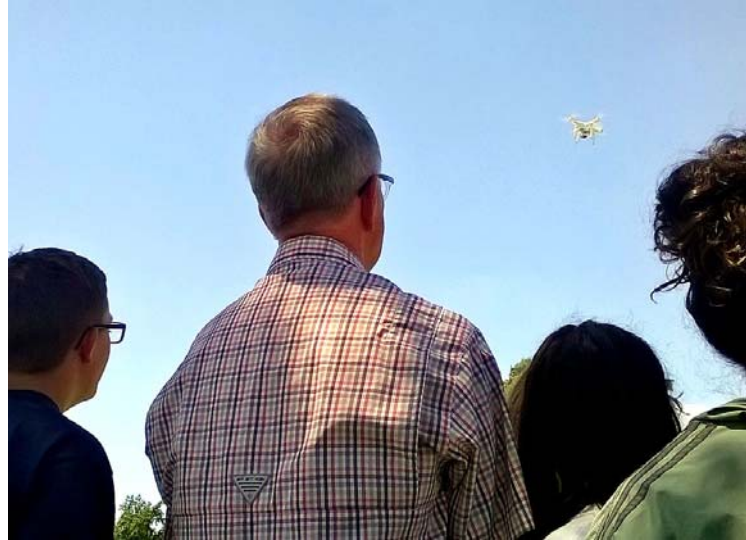
Watch that drone