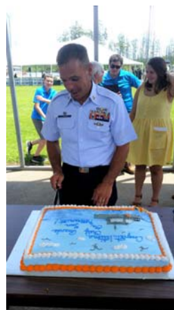
Where to start the cut?