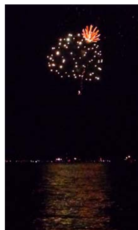
The big show

On 27 May, Bath continued its celebrations with a concert, skydivers, and fireworks. Most of the area's on-water response teams were on site (NC Wildlife, Sydney Dive Team, Bunyan and Bath FDs, USCG, Auxiliary, et al) as more than a hundred boats anchored in the small Bath Creek area to celebrate. Station Hobucken and Flotilla 20-06 served as picket boats to keep the danger area clear. When we stopped boats entering Bath Creek from the Pamlico River, we had excellent cooperation; all vessels thanked us for our warnings and anchored where we directed.