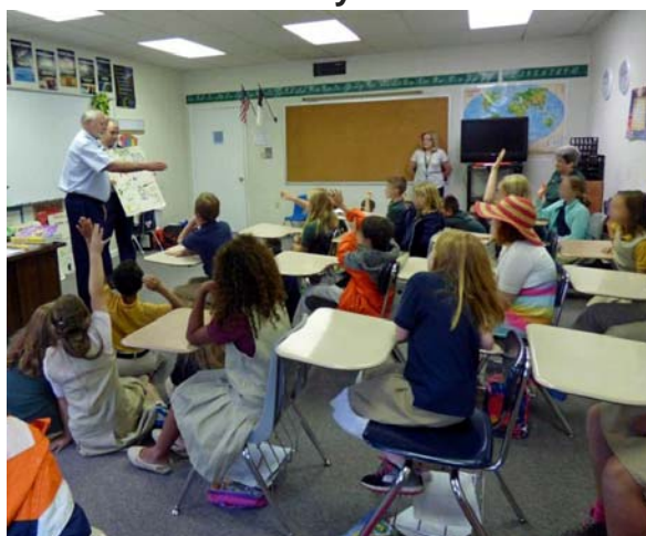
Calvary Baptist School on 24 May