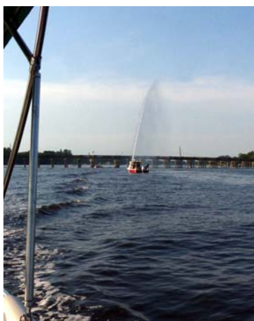
Bunyan FD boat