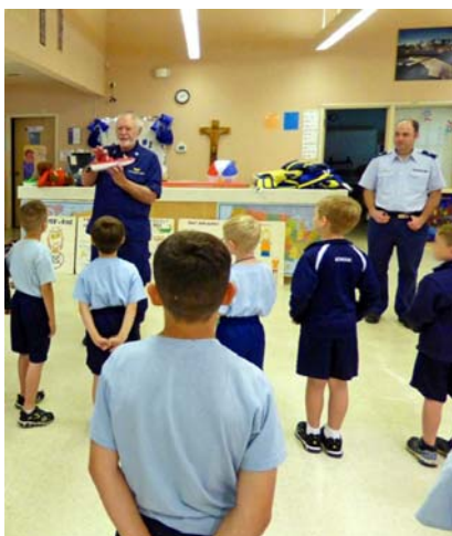
St. Paul School on 28 April