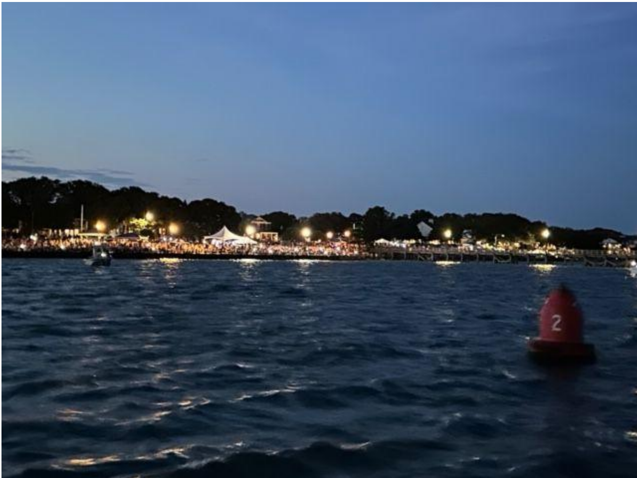
A view of the crowd on shore at Southport.