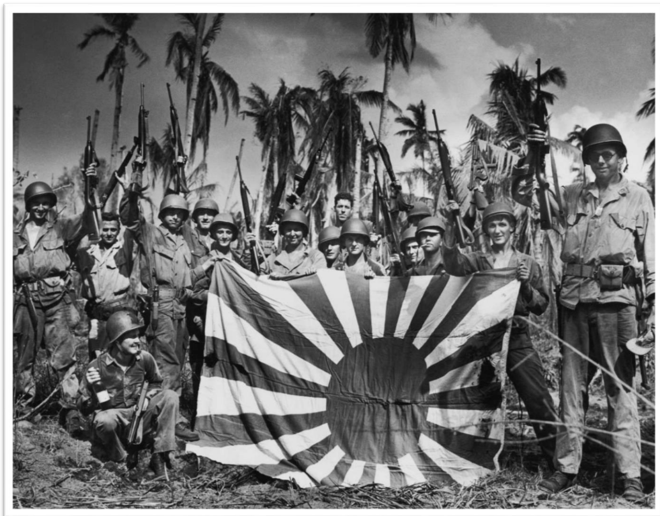
U.S. Coast Guardsmen pose with a captured Japanese flag Shortly after landing on Leyte Island on October 20, 1944